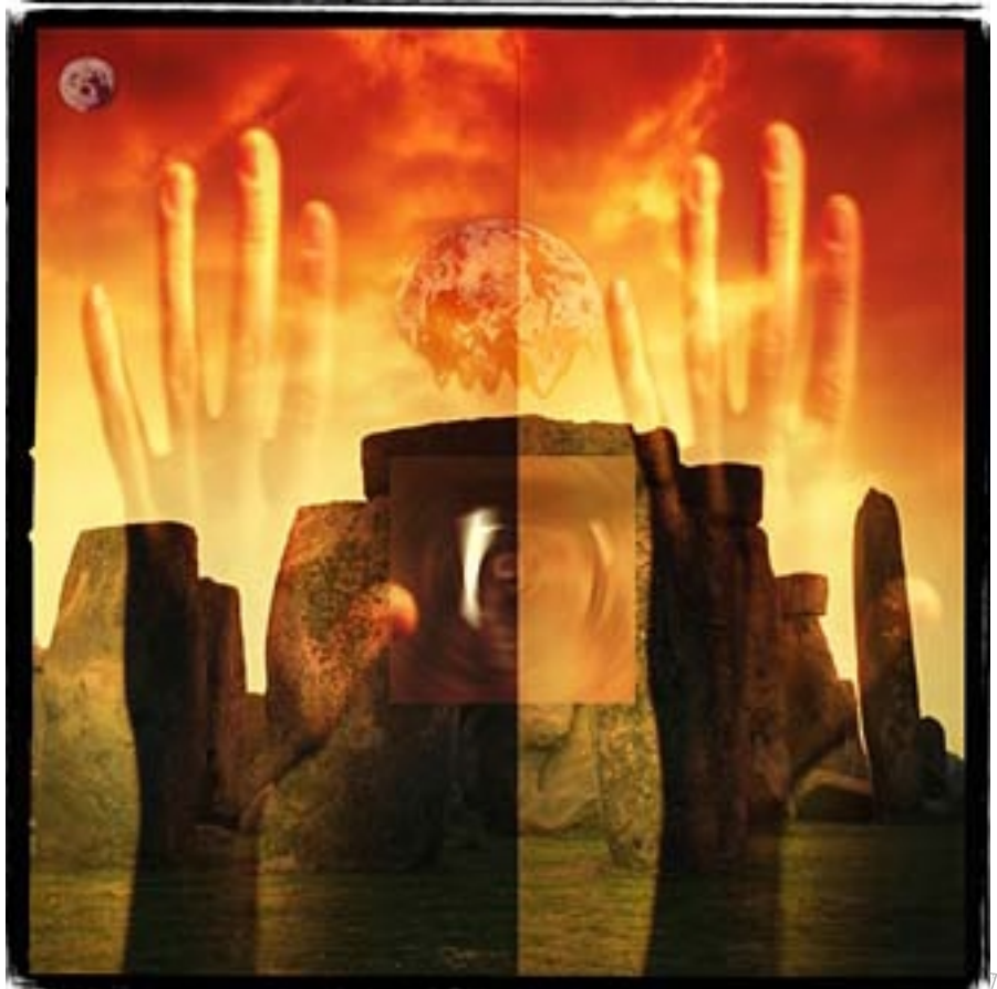
“Stonehenge”